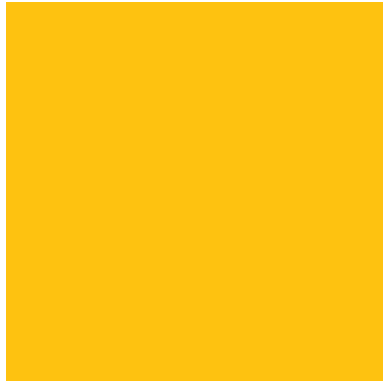
Primary Yellow C0 M25 Y100 K0

Our two primary colours are from the Amazing Thailand logo. Our secondary colours can vary as we take inspiration from the vibrant Thailand imagery used within our advertising. If we work with Sawasdee or another alternate third party then we use their colours.